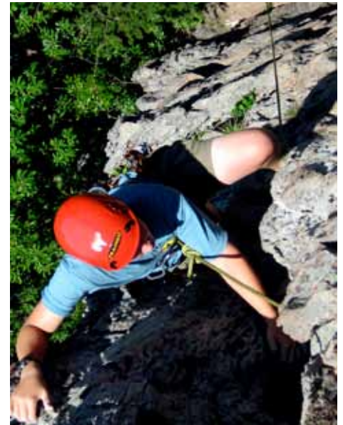
A (stud) participant from one of last summer's trips

up and busting at the seams to come are from local groups such as the Boys and Girls Club, Greenville County Recreation District, the Boys Home of the South, the Potential Youth Foundation and even some local youth groups. Right now the breakdown of day trips is about 40% rafting, 30% rock climbing, 30% hiking, and 100% awesome. We've also got three overnight (2 or 3 nights) trips scheduled, including a beach camping trip in August.